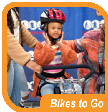
Bikes to Go