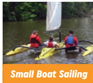
Small Boat Sailing