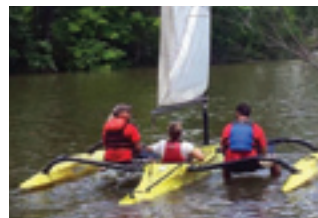
Small Boat Sailing