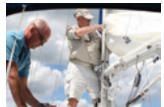
Big Boat Sailing