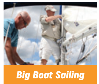
Big Boat Sailing