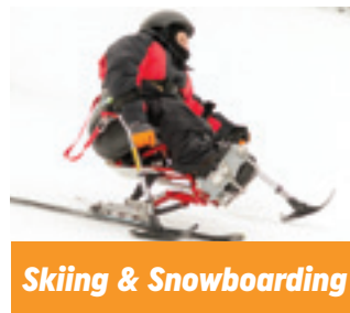
Skiing & Snowboarding