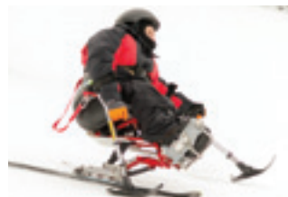
Skiing & Snowboarding